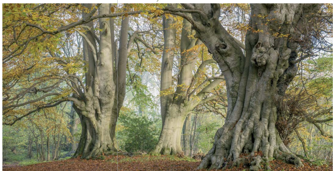
Left: Beech and oak leaves. Below: Ancient beech trees on the Cotswold Way, Lineover Wood, near Dowdeswell.

THE COTSWOLD LANDSCAPE AND ITS UNIOUE HABITATS